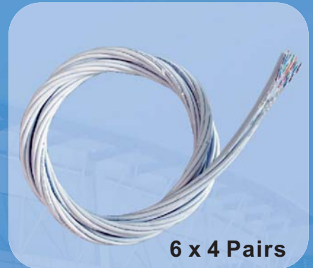
6 x 4 Pairs

For more information and free sample, pls feel free to contact us.