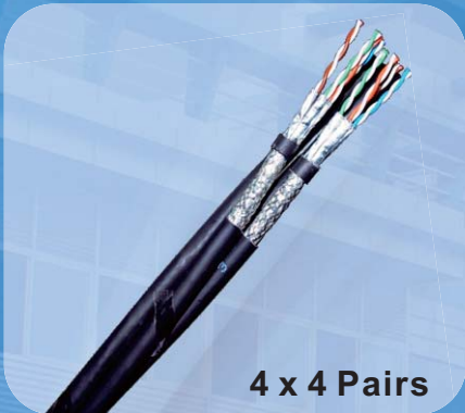
4 x 4 Pairs