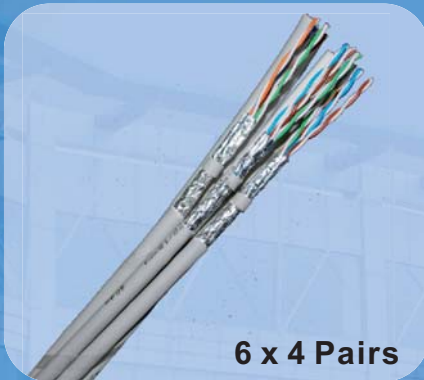
6 x 4 Pairs